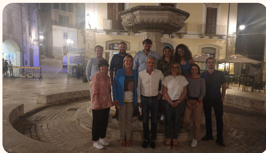
The working group after the welcome dinner

At least 40 subjects over the age of 45 are required, but this does not mean that other subjects of any age can also participate once it has been ensured that the 40 required subjects are present. 10 "students" per municipality could be involved, divided between Pacentro, Pettorano, Pescocostanzo and Cansano. The aim is to develop and promote the tourism market, strengthening the skills of those trained and involved in activities with high added value for health, adding an offer no longer limited to hotel services, but also other sectors such as nutrition, physical activity, as well as making tourist flows more sedentary and extensive.