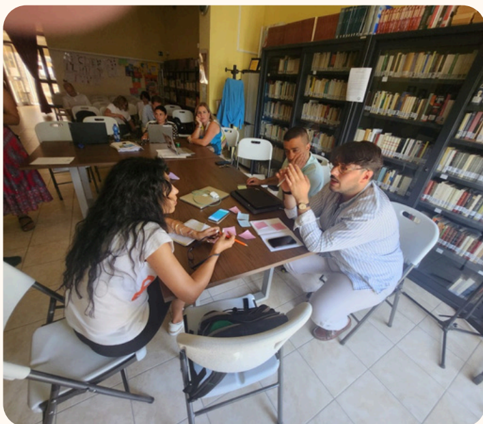
The work table

NewEcoSmart aims to create an inclusive social innovation approach to upskill adults aged 45 and above in rural areas, helping them adapt to the green and digital transitions in their current jobs or find new opportunities in habitat-related sectors. This initiative also promotes social entrepreneurial skills and mindsets that support the adoption of circular and socially responsible business models. An opportunity to increase work activities, reduce the migration of young people and develop the territory. The visit of the Italian and Spanish delegation to the villages of the Maiella Community lasted two days. Two days of intense activities to establish which citizens were most suitable and also most in need of learning new green and digital techniques, identifying the critical issues of the territory and trying to develop a concrete growth path in the medium and long term. The project includes training courses on digitalisation and green.