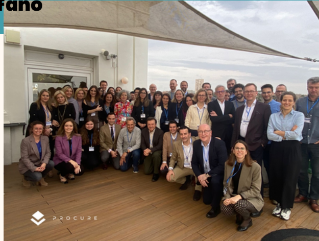
Team of Procure

The AHL Reference Sites Collaborative Network (RSCN) plays a pivotal role in the PROCURE project, which unites 25 partners from 12 EU countries to advance public healthcare procurement practices across Europe. Launched earlier this year, the initiative was funded through the EU4Health Programme, with partners comprising a diverse range of public and private healthcare institutions, procurement organisations, and suppliers. The participating Member States include Austria, Belgium, France, Greece, Hungary, Italy, Malta, Slovakia, Spain, Sweden, Portugal, and Romania. The COVID-19 pandemic underscored the necessity for enhanced coordination and collaboration within the healthcare sector at various levels. It revealed significant vulnerabilities in the supply chain, highlighting the need for innovative approaches to healthcare procurement to bolster the resilience of healthcare systems and prepare them for future public health crises. RSCN's Role in PROCURE. As the leader in Dissemination, Communication, Exploitation, and Impact Assessment for the PROCURE project, RSCN is essential in ensuring that the project's objectives are clearly communicated, and its outcomes maximised. Key objectives of RSCN's involvement include: