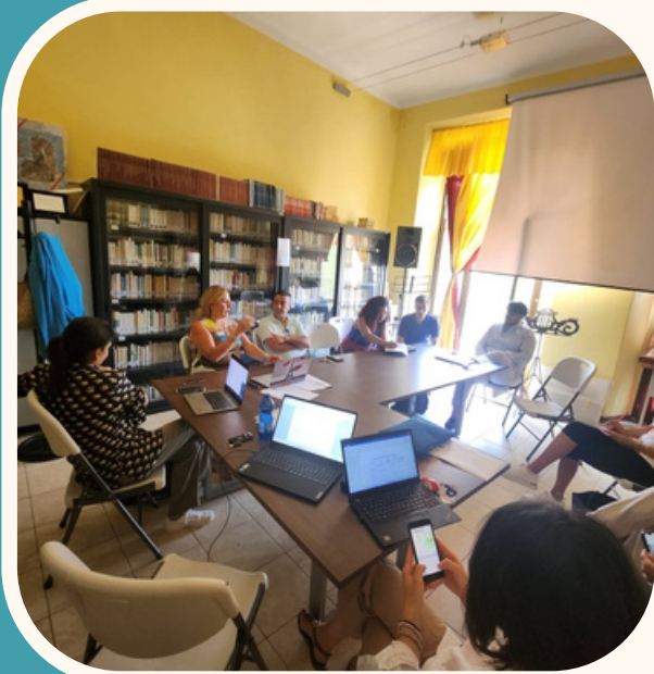
Discussion on the activities to be carried out

At least 40 subjects over the age of 45 are required, but this does not mean that other subjects of any age can also participate once it has been ensured that the 40 required subjects are present. 10 "students" per municipality could be involved, divided between Pacentro, Pettorano, Pescocostanzo and Cansano. The aim is to develop and promote the tourism market, strengthening the skills of those trained and involved in activities with high added value for health, adding an offer no longer limited to hotel services, but also other sectors such as nutrition, physical activity, as well as making tourist flows more sedentary and extensive.