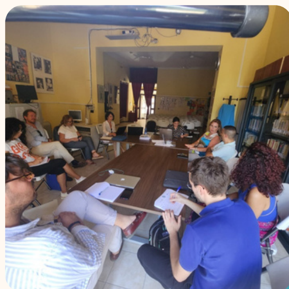
The work table