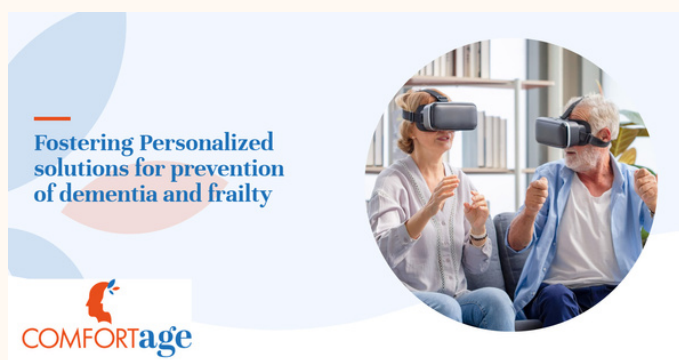
Team ComfortAge and the project

In conclusion, the COMFORTage Community Forum is essential in enhancing dementia and frailty care across Europe. By fostering collaboration, sharing best practices, and driving innovative solutions, the CCF supports the immediate goals of the COMFORTage project while ensuring its long-term relevance in improving the quality of life for those affected. Webpage link: https://comfortage.eu/